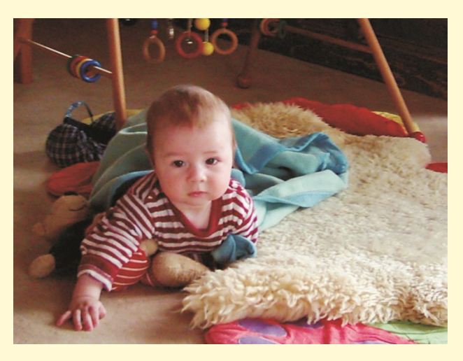
Information for Parents and Interested Parties