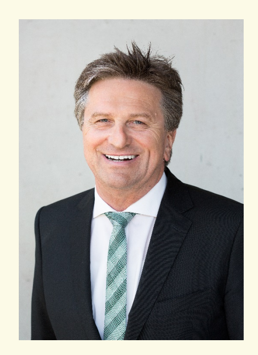
Manne Lucha MdL Minister for Social Affairs and Integration Baden-Wuerttemberg

I wish you and your family all the best and lots of fun!